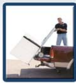
Portable Tailgate Lift